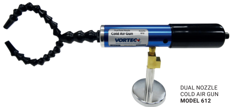
DUAL NOZZLE COLD AIR GUN MODEL 612