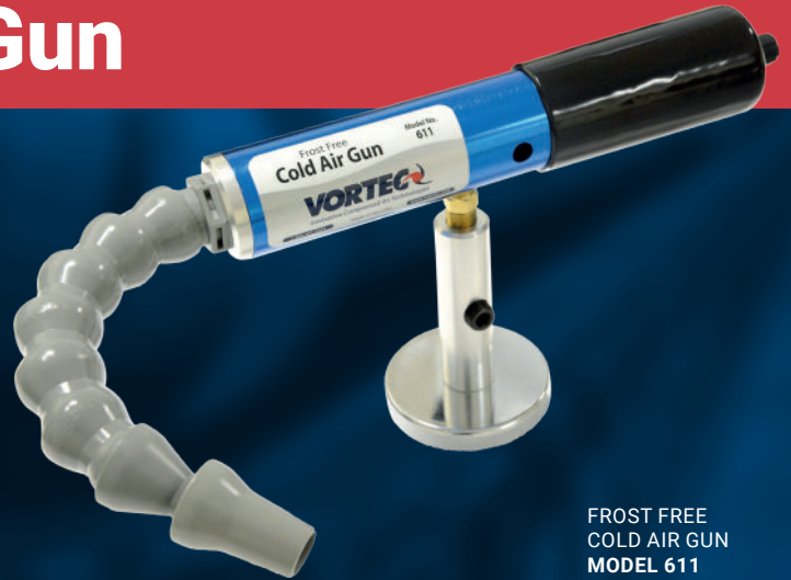
FROST FREE COLD AIR GUN MODEL 611

The Frost Free Cold Air Gun eliminates the mess associated with condensation and frost arising from continuous use of a Cold Air Gun. A must have for sensitive applications such as fabrics, wood, cardboard and paper; as well as standard metalworking applications.