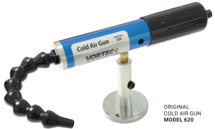
ORIGINAL COLD AIR GUN MODEL 620

The effective cooling from a Cold Air Gun can eliminate heat-related parts growth while improving parts tolerance and surface finish quality.