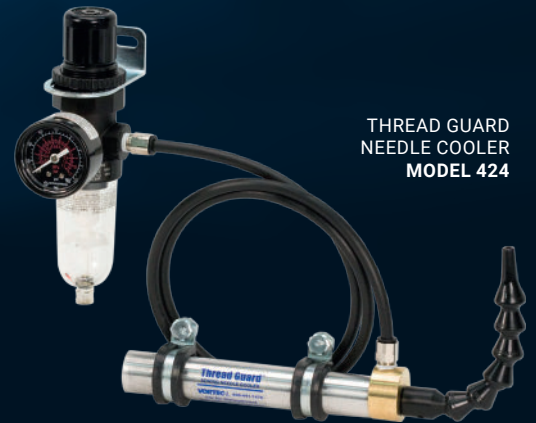
THREAD GUARD NEEDLE COOLER MODEL 424

The air stream is especially effective on difficult sewing surfaces such as belt loops and waist bands; or on tough materials like denim or canvas. Cold air temperature and flow rate are preset to 10°F and 4 SCFM.