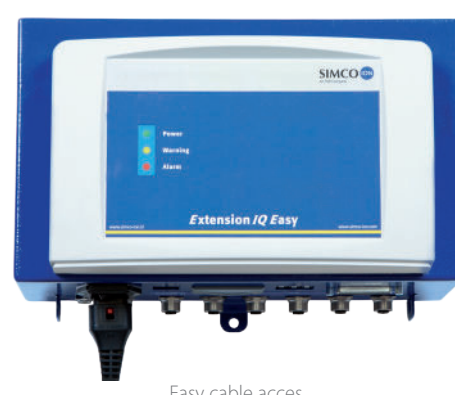
Easy cable acces