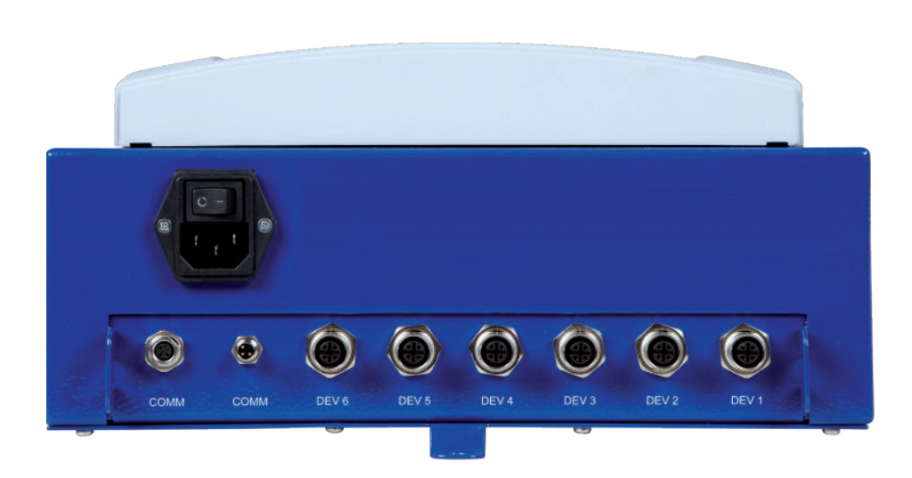
Connection of up to 6 devices